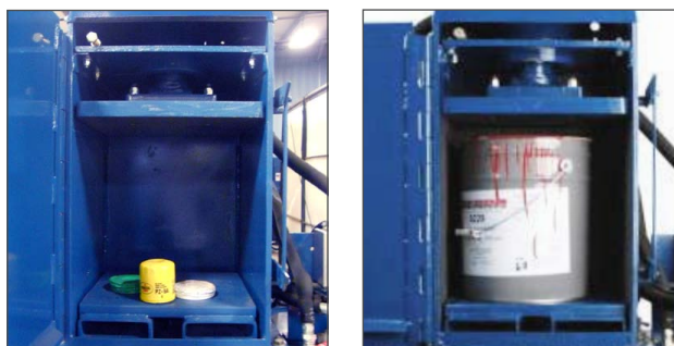
Model TC-16 – Compaction Chamber Interior Views